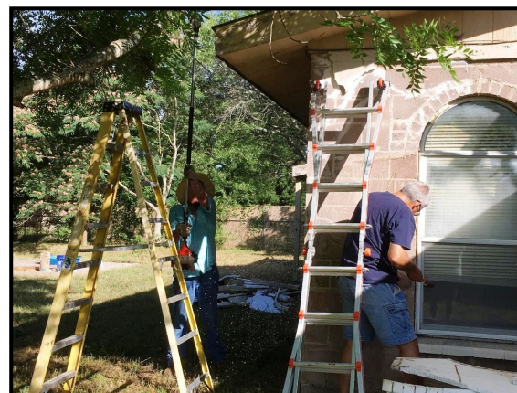
Nimitz Rotary Club Cleaning Yard and Preparing to Paint House.