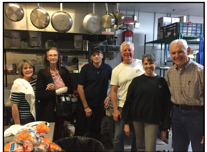
The Oak Hills Dinner Team

More photos of this event can be seen on our website wwnebo.org or Facebook.