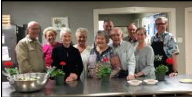
The 'Purpose Driven Bible Study Group' hosted Friday evening.

Great turnout at the Golden Hub. The host team was outstanding. The food was scrumptious. Our guests were delighted. Doesn't get much better than that!