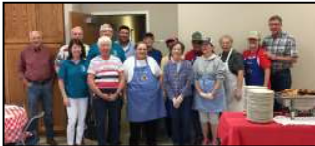
Holy Ghost Lutheran Church hosted Saturday evening.